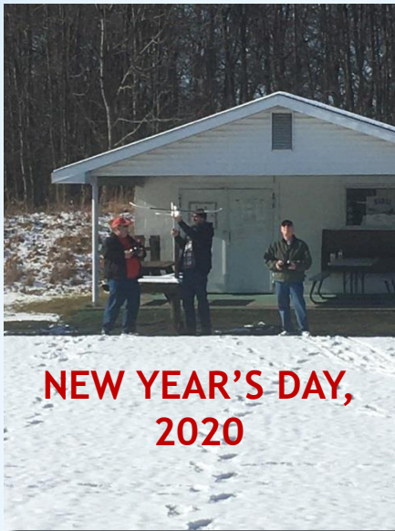
Part of the attending crowd.